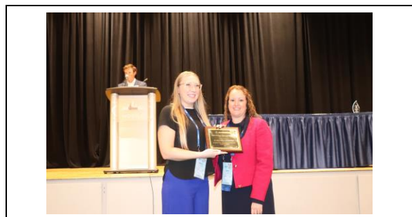
CT Perry Treatment Plant Montgomery Water Works & Sanitary Sewer Board (Montgomery, Alabama)